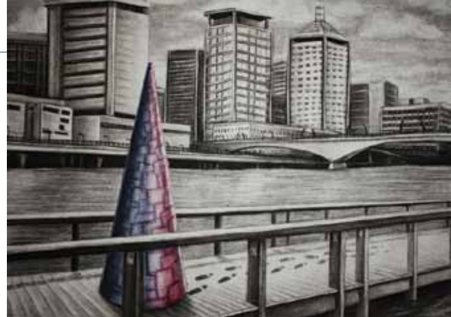
detail of Humanity and our worldly experience

My work reflects aspects of how people conduct themselves in our contemporary world. I wondered what would become of humanity in the future. Could humanity doom itself? The work swings to the idea of how every individual has their own perspective on the world, and how our limited views of the world could end up being the cause for our ultimate destruction. Ignorance leads to a lack of understanding which leads to misunderstanding which leads to conflict. The cones should not be there. Humanity should be trying to look further beyond their individual perspectives, to strive and see the whole world perspective.