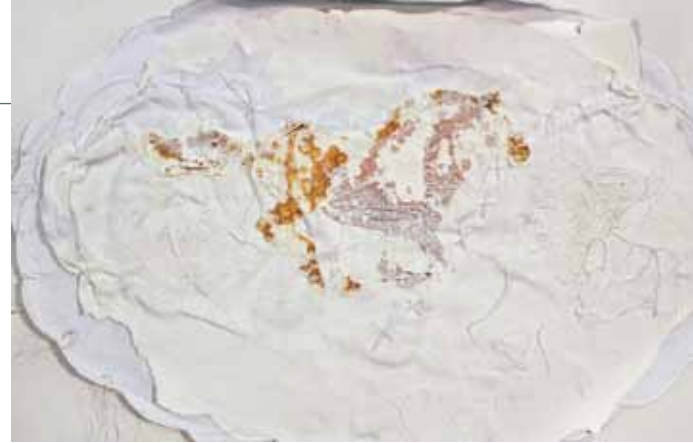
detail of For Patrick

Patrick was my best friend's horse. Horses evoke a very strong sense of presence, and the bond between a human and their horse is very strong. There was great loss and sadness when this bond was broken with Patrick's death. Horses are very tactile animals. We pat and stroke them, brush them and hold them. I decided to make a set of works, using mainly textiles, reminiscent of shapes and textures I associated with Patrick when I used to look through our kitchen window at him.