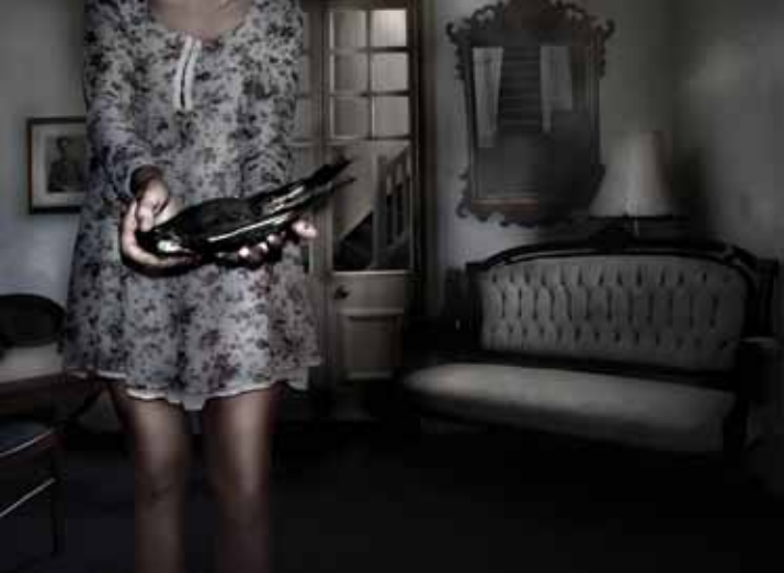
detail of These houses and rooms are full of perfumes