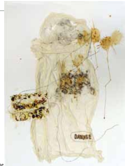
detail of You damage

This piece reflects my childhood and the adversity I faced as a child. With various aspects symbolising my father, perfection, personal quotes and thoughts. The letters convey a message that was always thought but never dared to be said, only written. The red stitching screams a message that I was never able to. Stitching represents the tedious and long time that was spent dwelling on and trying to mend the pieces of what was so broken in the past.