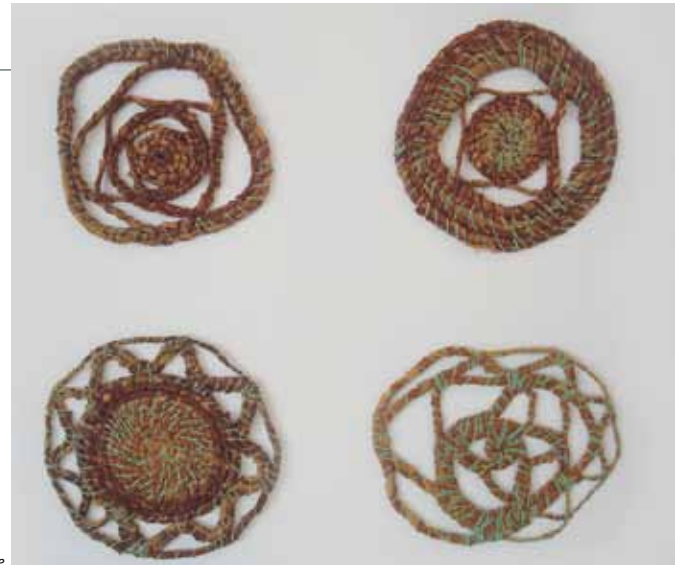
detail of Woven time

In recent decades, thousand-year-old customs relating to weaving and sewing have begun to disappear as women become more career-focused. My work explores the need for ongoing knowledge and relation to the past using modern materials. The strength of people and culture is represented through the weaves and string. Each weave is symbolic of the customs of cultures, which continue on over time. The binding string represents the people who have maintained and strengthened the traditions.