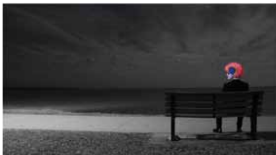
detail of Laughter and shadows