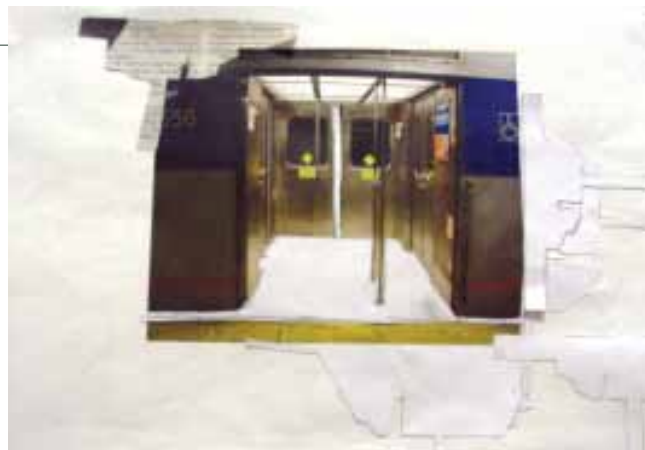
detail of Accessing the world

People with physical disabilities are locked out of much of the physical environment in society. Train platforms, flights of stairs, buses etc. often present obstacles to those experiencing disability. This work details that exclusion by symbolically blocking their paths with gestures of the everyday (eg. newspaper, magazines). I have manipulated the compositions to cut-out entry-point shapes and reposition them compositionally to emphasise a shift in perspective. My hope is that a conceptual shift could be perceived in our communities. With effort, conventional views and methods for accessing the world could be reconfigured.