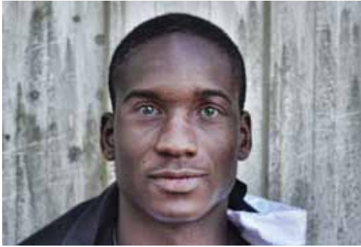
detail of Race